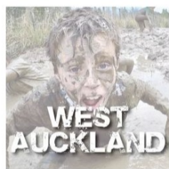
Kumeu - Auckland

Closing date for payments and entries is 10 July, please see skool loop for entry information.